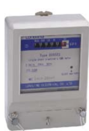
DDS523-(D) Glass cover