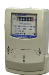
DDS523-(F) Transparent cover