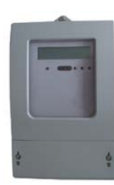
DDS523-(Q) Glass cover