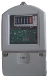
DDS523-(M) Transparent cover