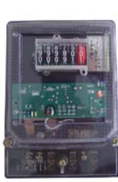
DDS523-(O) Transparent cover