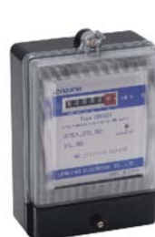
DDS523-(E) Transparent cover