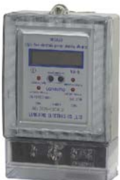
DDS523-(I) Transparent cover