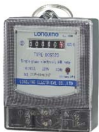
DDS523-(A) Transparent cover