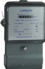
DDS523-(J) Iron base Glass cover