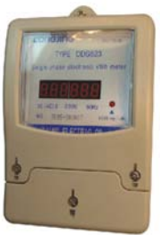
DDS523-(H) Transparent cover