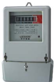
DDS523-(L) Glass cover