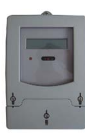
DDS523-(P) Transparent cover