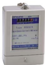
DDS523-(C) Glass cover