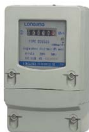
DDS523-(G) Transparent cover