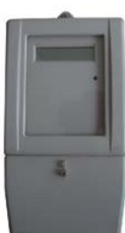
DDS523-(N) Glass cover