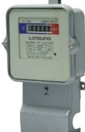
DDS523-(K) Iron base Glass cover